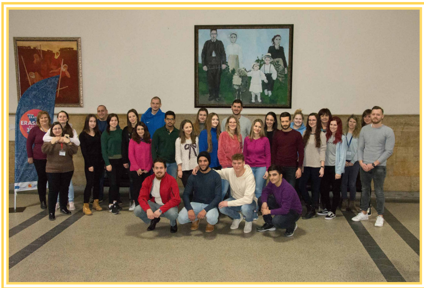
Incoming Erasmus+ Students 2018/2019 academic year summer semester